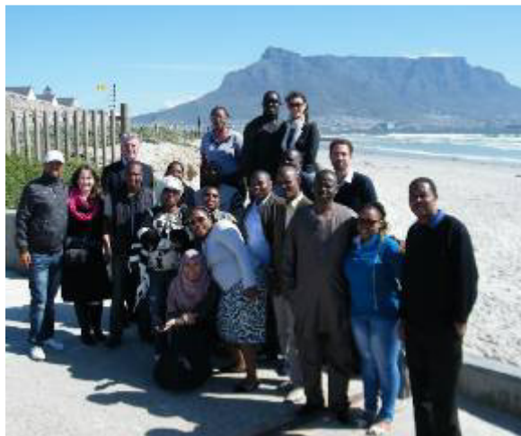
Left: Part of the team at Milnerton Beach, Cape Town.