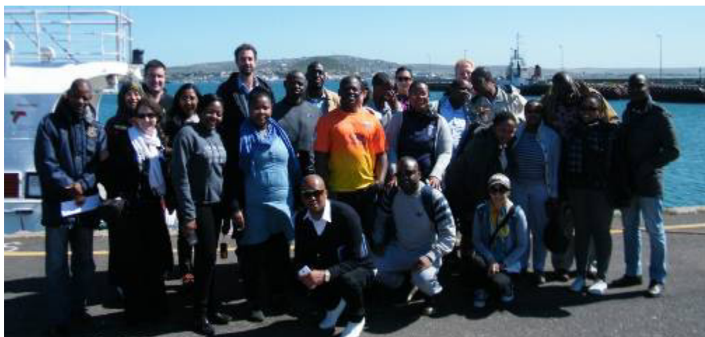
IOI Southern Africa: Training Programme Class of 2015 on a field visit during the programme.

The 19 delegates from 8 different countries in Africa (Angola, Egypt, Ivory Coast, Kenya, Madagascar, Namibia, Nigeria, and the Republic of South Africa) descended on the SANBI buildings at Kirstenbosch National Botanical Gardens for lectures from over 40 regional and local experts representing over 20 different organisations.