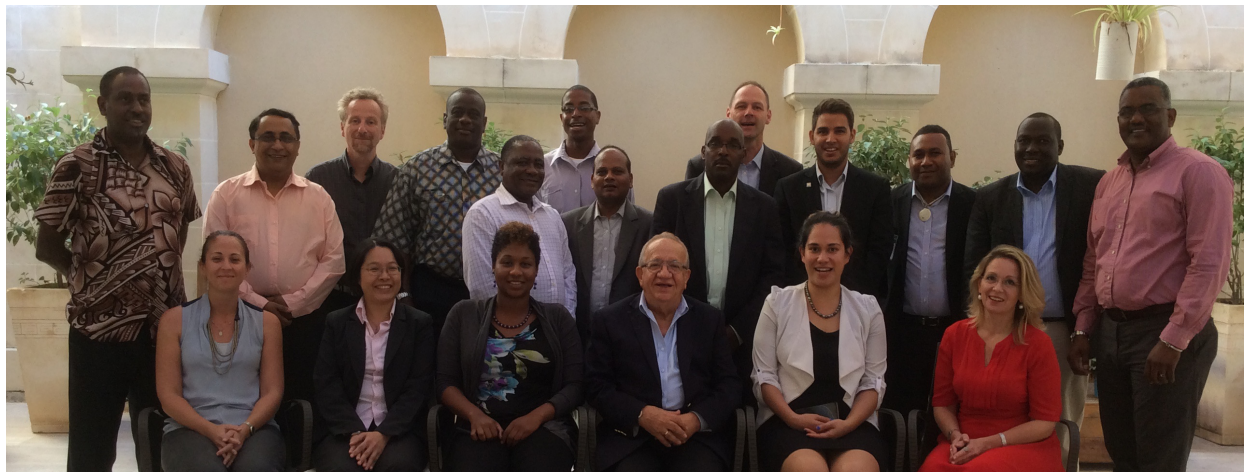
Above: Course faculty and staff from IOI and the Commonwealth Secretariat with the programme participants.

MALTA THIRD COUNTRY TRAINING PROGRAMME Ocean Governance and Blue Growth - Training Programme offered in Malta by the IOI and the Commonwealth Secretariat 17th -23rd September 2015