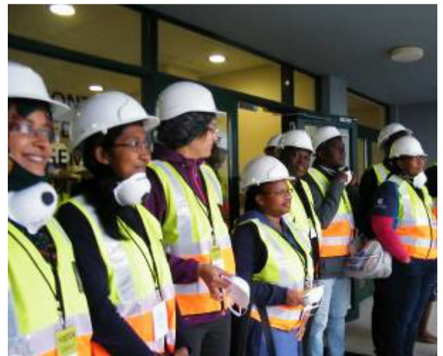
Right: Part of the team at Kraaifontein Recycling Sorting Plant, Cape Town